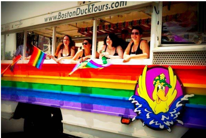
2007 Youth Pride Participants riding Duck Boat: South End Sara (Generously donated – Thanks!)